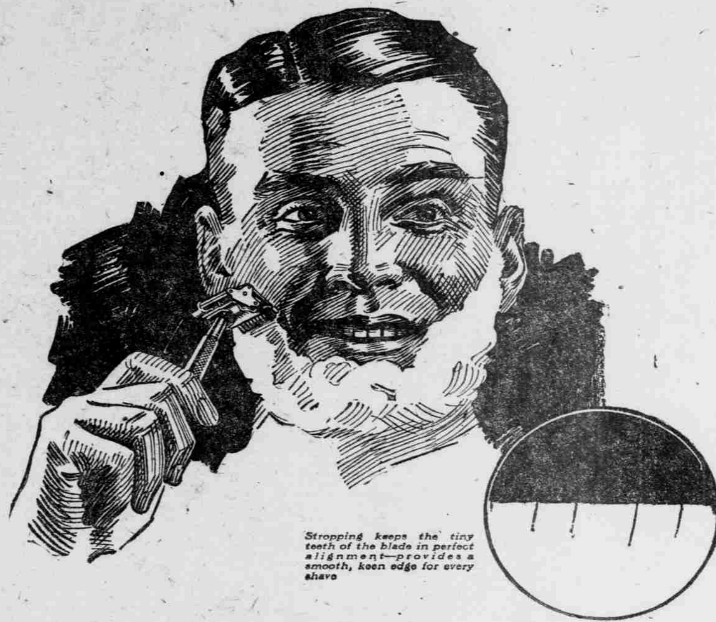
Stropping keeps the tiny teeth of the blade in perfect alignment—provides a smooth, keen edge for every shave