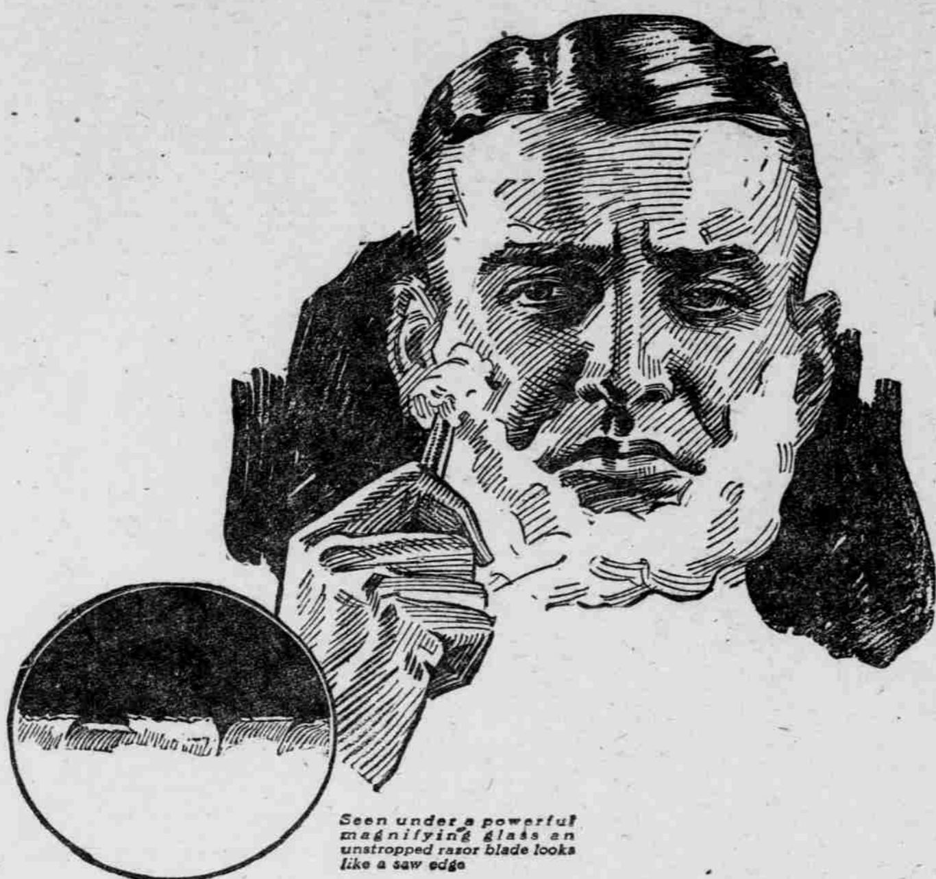
Seen under a powerful magnifying glass an unstropped razor blade looks like a saw edge