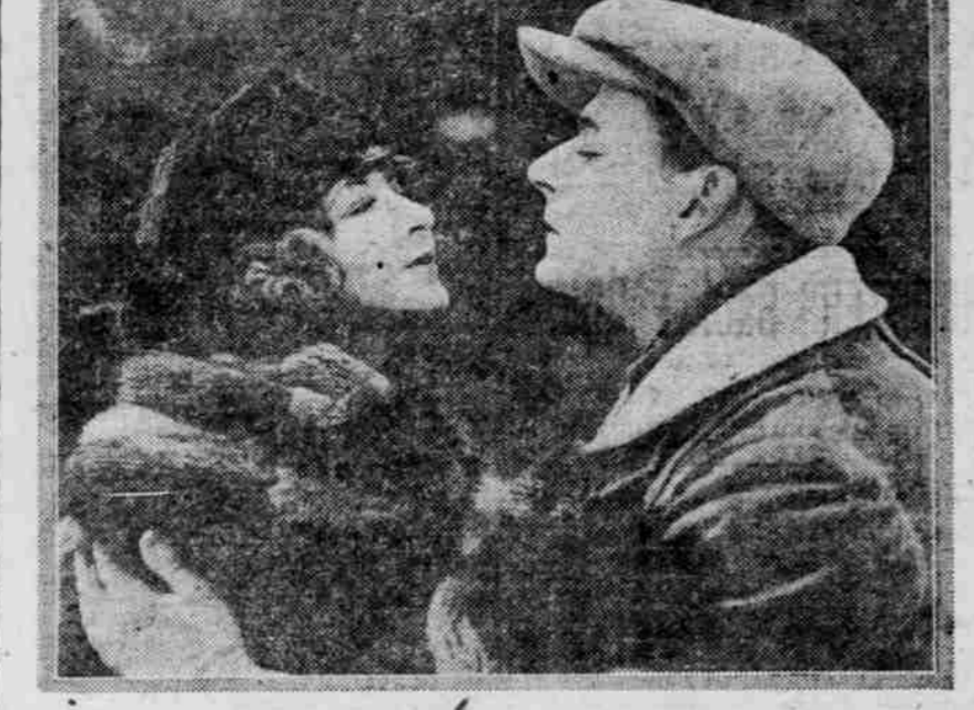
Moment from "The Law of the Yukon," adapted from the poem of the same name by Robert Service and showing this week at the Majestic theater.

TODAY'S FILM FEATURE. Majestic—Pauline Frederick, "Madame X." Peoples—George Walsh, "Sink or Swim." Columbia—Thomas Meighan, "Civilian Clothes." Rivoli—"The Law of the Yukon," adapted from Robert Service's poem.