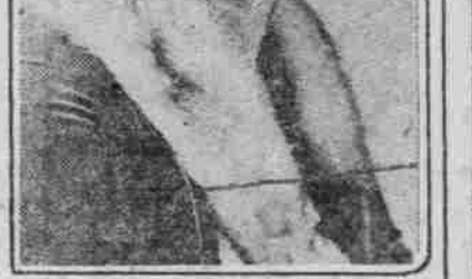
Harold Vermilye, BURNELL, SEATTLE.