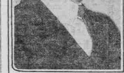
Harold Vermilye, BURNELL, SEATTLE.