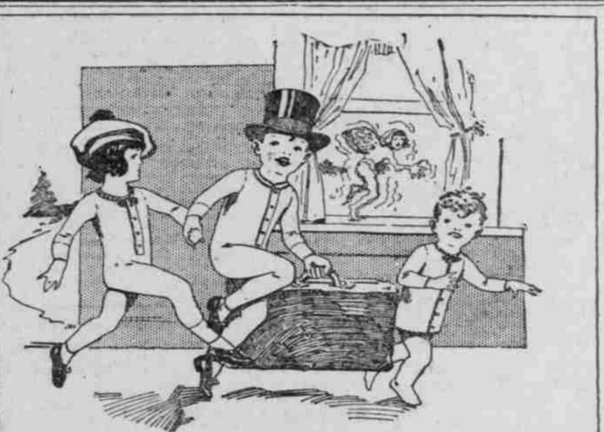
Scared and startled to the core, Out the window SHIVERS shoot When the TWINS come in the door In their Lackawanna Suits.