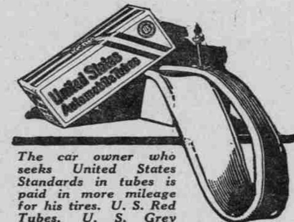
The car owner who seeks United States Standards in tubes is paid in more mileage for his tires. U. S. Red Tubes. U. S. Grey Tubes.

The United States Rubber Company has never asked truck owners to pay for its tire experiments.