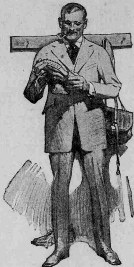
Copyright 1920 Hart Schaffner & Marx

You'll want some summer clothes to take on your vacation—here's a chance to save money.