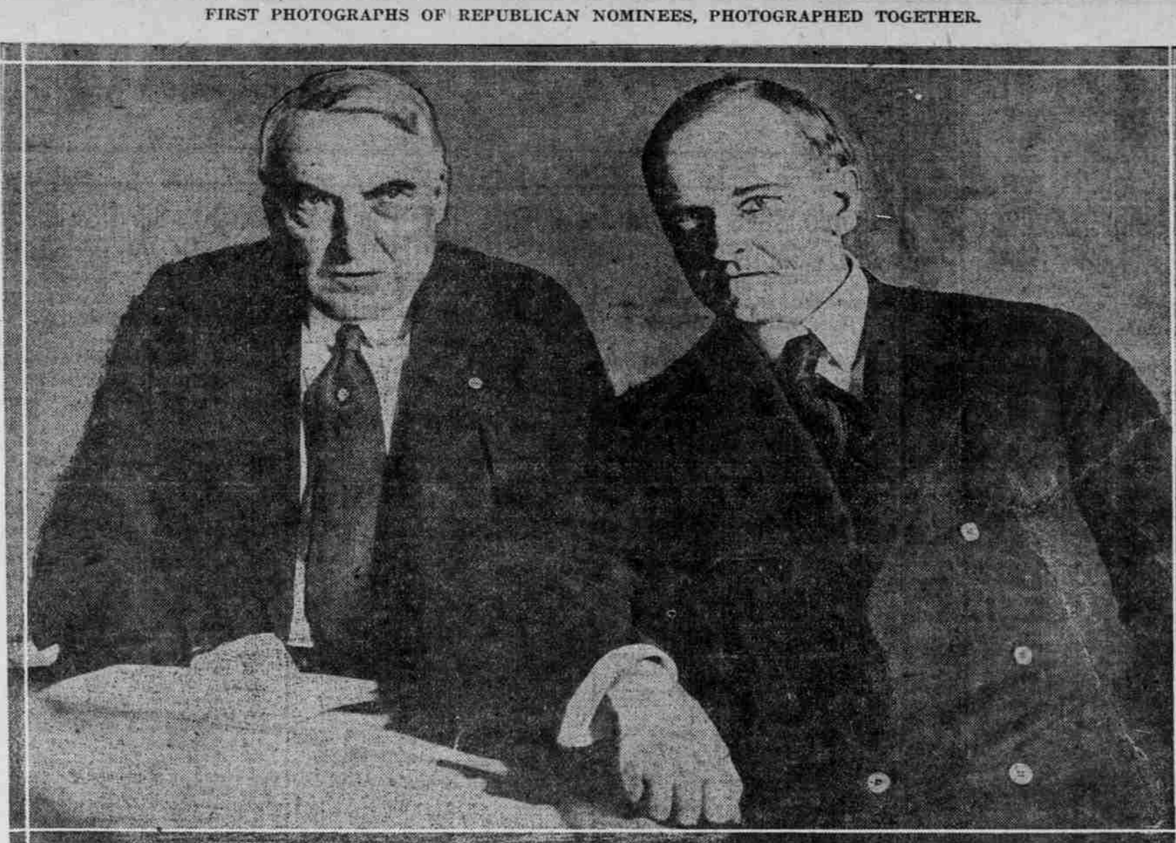
SENATOR HARDING AND GOVERNOR COOLIDGE IN CONFERENCE AT WASHINGTON.

The day, the occasion, the presence of the republic's defenders in the world war, and the veterans of the Spanish-American war and the war for union and nationality—all combine to remind me you have been observing the anniversary of the republic's independence. Let us pledge ourselves anew, one and all, that the heritage handed to us through the heroism and sacrifices of the founding fathers shall be held sacred, unbridled and undimmed, and American nationality shall be the inspiration of the myriads of Americans of the future even as it stirs our hearts today.