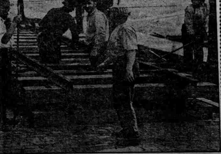
TRAINS WILL BE PARKED AMID GREENERY OF PARK BLOCKS.