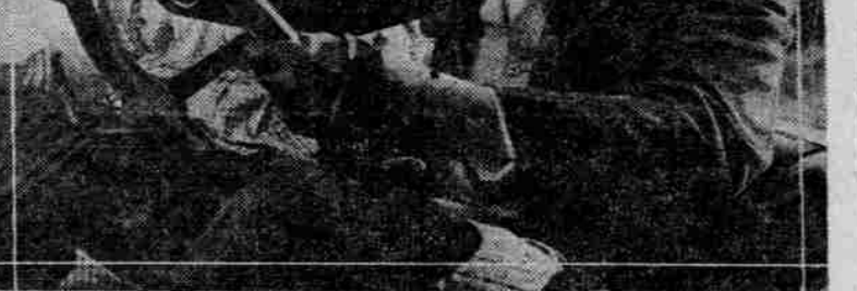
Moment from Nazimova's latest success, "The Heart of a Child," showing at the Liberty until tomorrow midnight.

Mr. Whitlock Alleged to Have Been Offered $500,000 to Speak for German Rule.