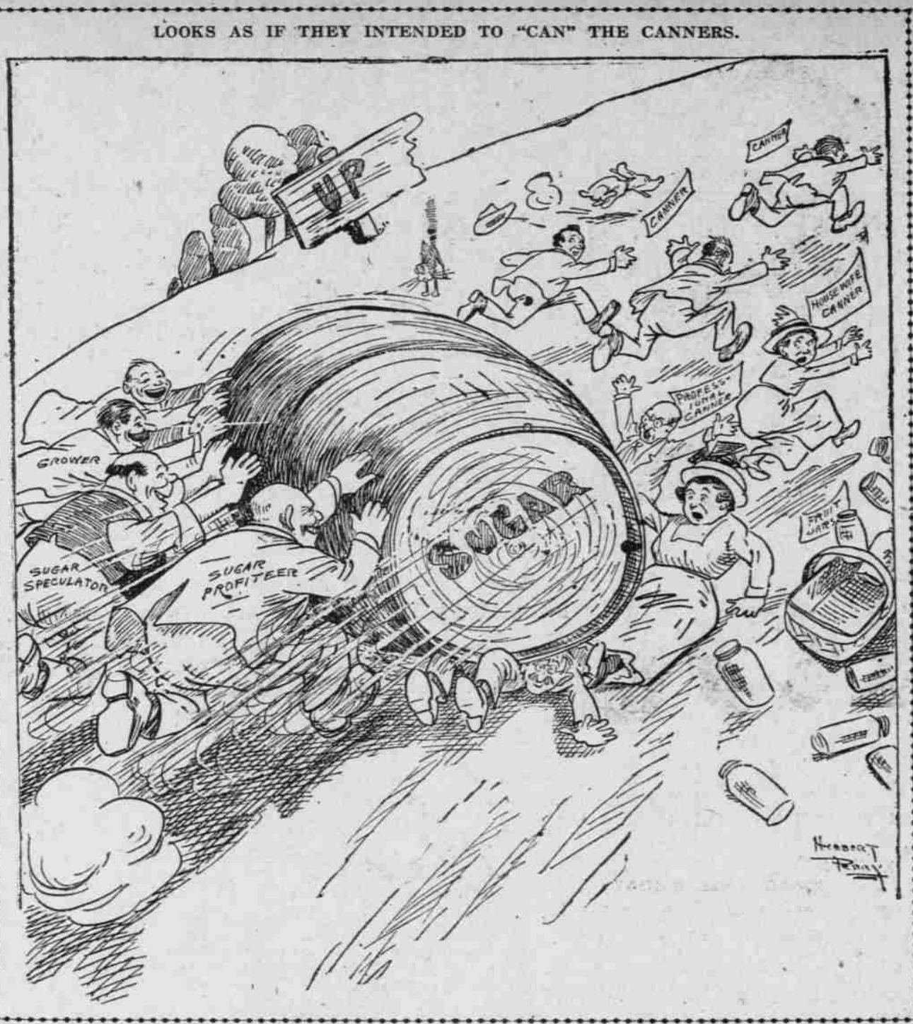
LOOKS AS IF THEY INTENDED TO "CAN" THE CANNERS.