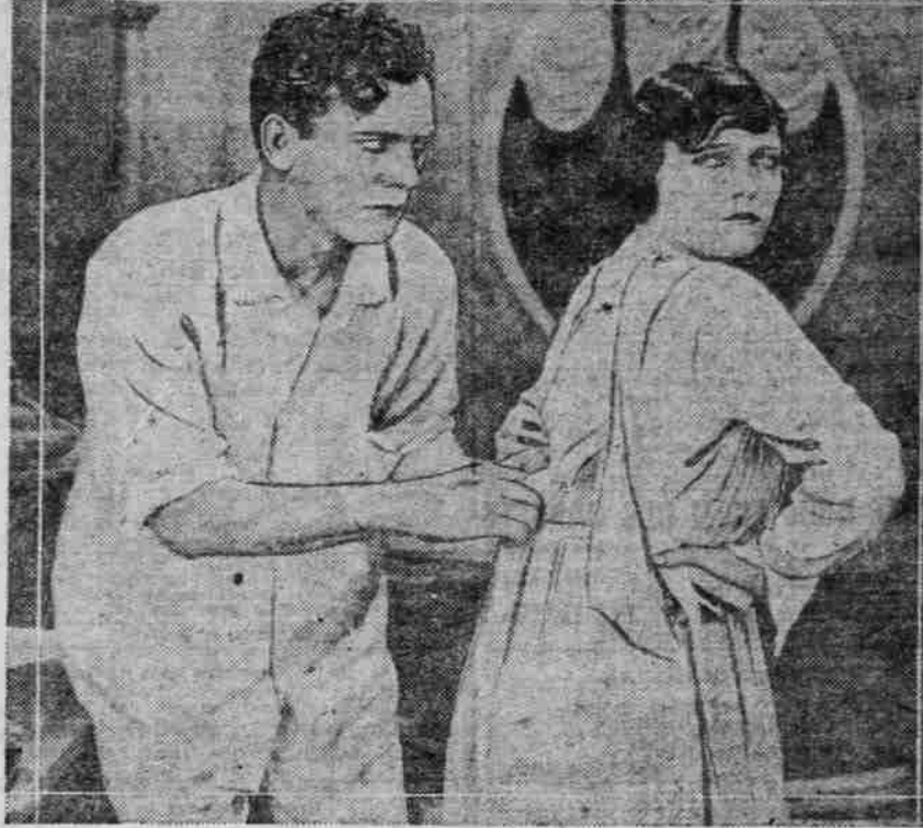
Thomas Meighan and Gloria Swanson, in "Why Change Your Wife?" the Cecil B. DeMille photoplay now in its second week at the Columbia theater.

TODAY'S FILM FEATURES. Rivoli — Alice Lake, "Shore Acres." Majestic—Mack Sennett's "Down on the Farm." Columbia—Thomas Meighan and Gloria Swanson, "Why Change Your Wife?"