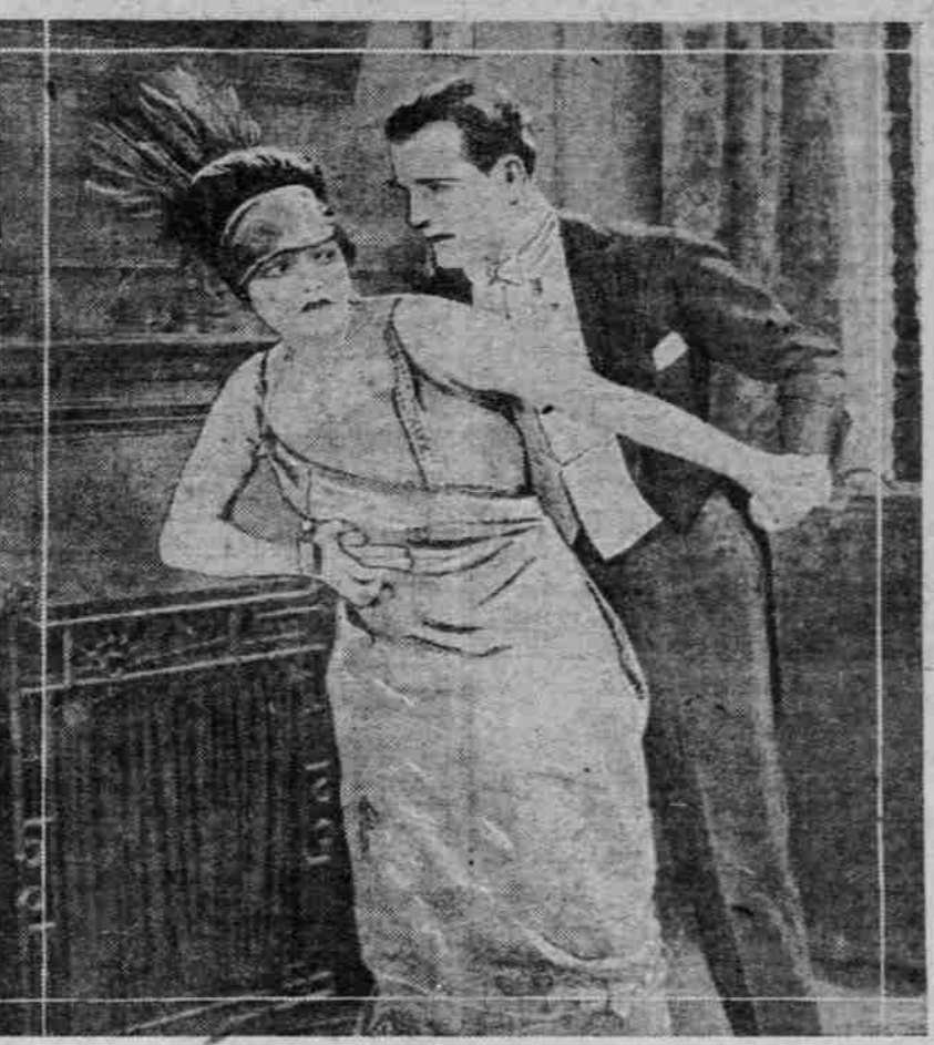
Madame Marguerite Sylva and Nigel Barrie, in a scene from the photo version of Samuel Merwin's novel, "The Honey Bee," showing their work at the Rivoli theater.

TODAY'S FILM FEATURES. Majestic—Rex Beach's "The Silver Horde." Peoples—D. W. Griffith's "Scarlet Days." Liberty—Mark Twain's "Huckleberry Finn." Columbia—Thomas Meighan and Gloria Swanson, "Why Change Your Wife?" Rivoli—Samuel Merwin's "The Honey Bee." Star—William Russell, "Shod With Fire." Circle—Nadimova, "The Brat." Globe—Corinne Griffith, "The Bramble Bush."