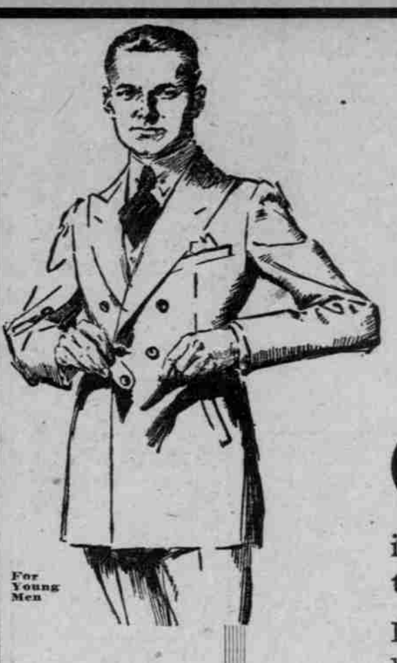
For Young Men

OREGON AGRICULTURAL COLLEGE, Corvallis, April 18.—(Special.)— The annual military ball, staged by the cadet officers of the cadet corps, held here last night in the men's gymnasium, was attended by nearly 400