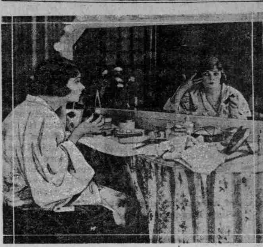
Norma Talmadge, as she appears in 'The Loves and the Lies' the comedy-drama which will continue to show at the Liberty theater until tomorrow midnight.

Picture house in Portland. A special film is being planned for the occasion; its nature, however, is being kept secret. Arrangements are being made for an elaborate tableau presenting a fairly tale familiar to all children and which will be followed by comedy, cartoon and animal pictures.