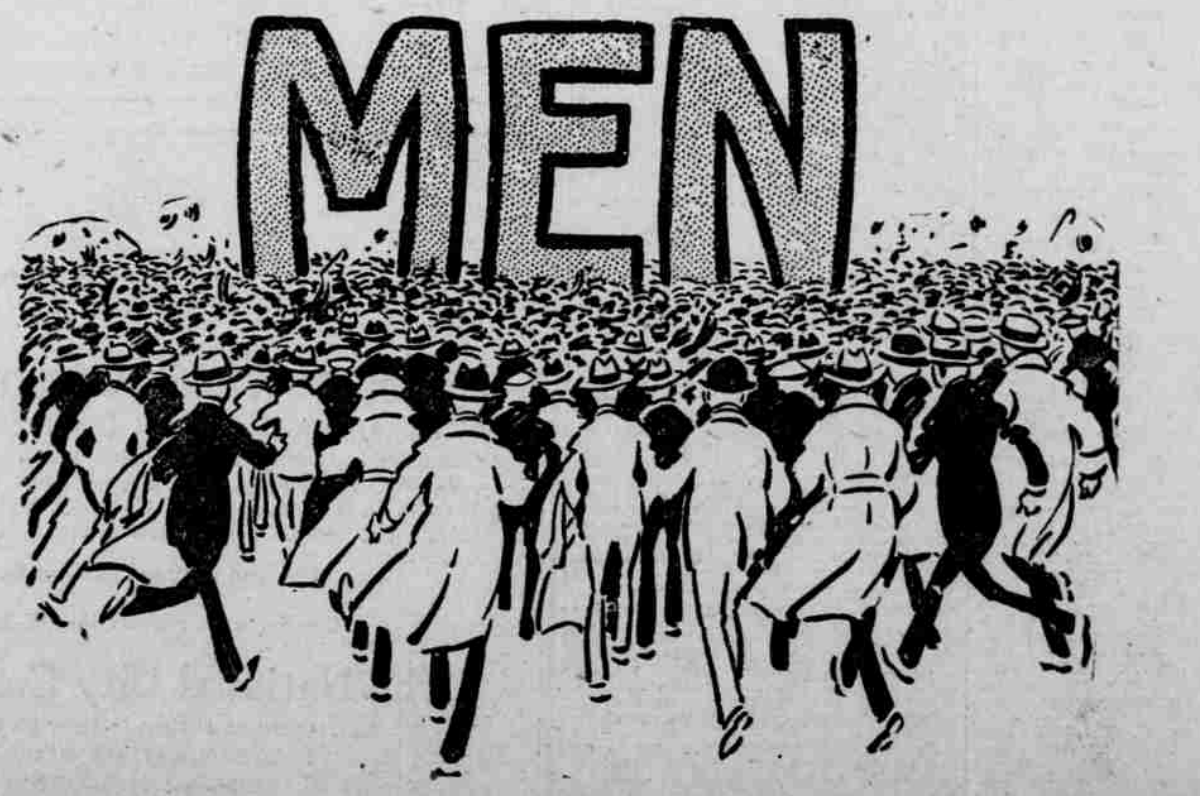
Meier & Frank's: The Store for Men, Main Floor (Inside Morrison Entrance.)

Girls' New Sports Coats Checks, polo cloth, tweeds and other materials. Sizes 10 to 16 years. Prices begin at $20.