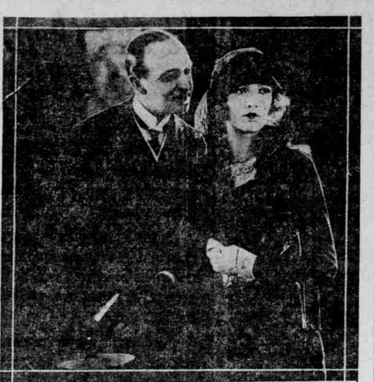
Chloe Constance Talmadge, as she appears in her latest comedy drama, "Two Weeks," which tells a mad story of a lovable chorus girl and three staid old bachelors. It is now being at the Columbia theater.

Today's Film Features. Peoples—Elsie Hammerstein, "The Country Cousin." Rivoli—Geraldine Farrar, "Flame of the Desert." Liber 7—William Farnum, "Wings of the Morning." Maestri—Allan Dwan Production, "The Luck of the Irish." Columbia—Constance Talmadge, "Two Weeks." Star—Harold Bell Wright's "Shepherd of the Hills." Sunset—Dorothy Dalton, "Flame of the Desert." Circle—Ethel Clayton, "More Deadly Than the Male."