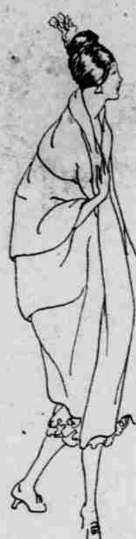
—Meier & Frank's: Fourth Floor. (Mail Orders Filled.)

Short coats of velvety black have narrow patent leather belts and white satin linings.