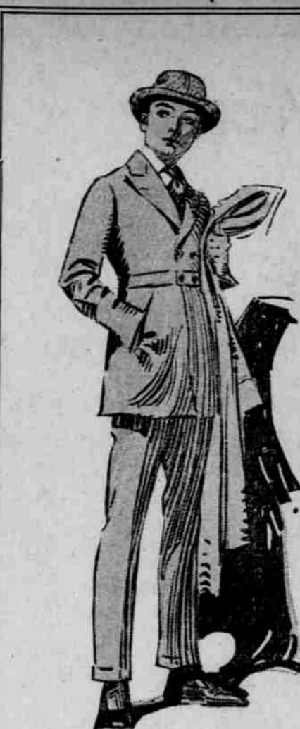
Copyright 1919, Hart Schaffner & Marx

Get a small package of Hamburg Break Tea at any pharmacy. Take a tablespoonful of this Hamburg tea, put a cup of boiling water upon it, pour through a sieve and drink a teacupful at any time. It is the most effective way to break a cold and cure grip, as it opens the pores, relieving congestion. Also loosens the bowels, thus breaking a cold at once. It is inexpensive and entirely vegetable, therefore harmless.