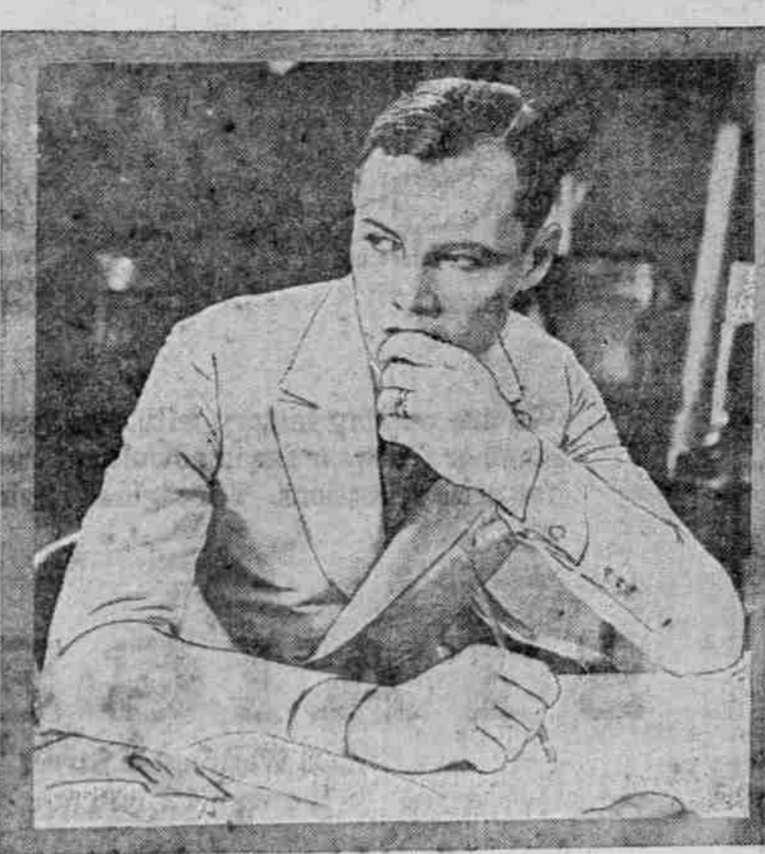
Charles Ray, in "Red-Hot Dollars," which is showing in conjunction with Charlie Chaplin's "A Day of Pleasure" at the Liberty theater.

TODAY'S FILM FEATURES. Rivoli—Marie Doro, "Twelve-Ten." Columbia—Bryant Washburn, "Too Much Johnson." Peoples—Mary Pickford, "Pollyanna." Majestic—Special production, "The Westeners." Liberty—Charlie Chaplin, "A Day of Pleasure"; Charles Ray, "Red-Hot Dollars." Star—Earle Williams, "When a Man Loves." Sunset—Robert Warwick, "Told in the Hills." Circus—Norma Talmadge, "The New Moon."