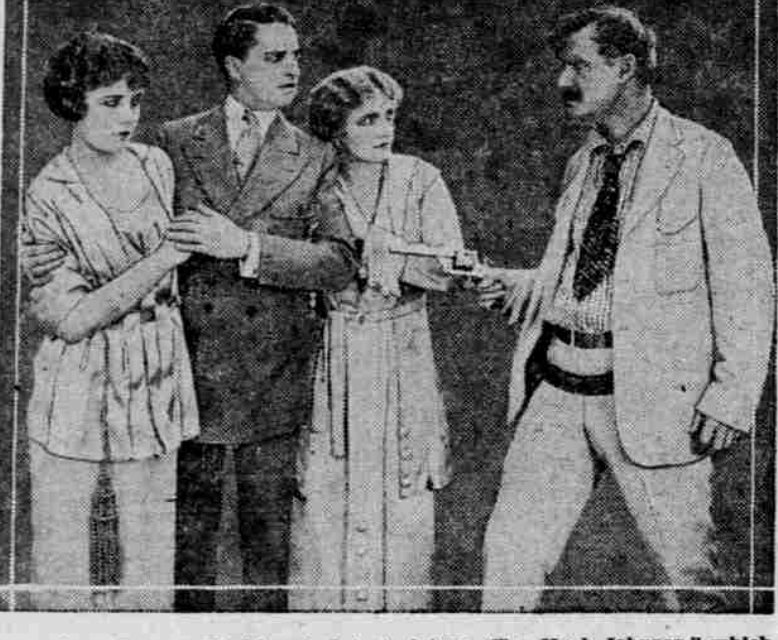
Scene from Bryant Washburn's latest picture, "Too Much Johnson," which will open today at the Columbia theater.

TODAY'S FILM FEATURES. Rivall—Marie Doro, "Twelve Ten." Majestic—Special production, "The Westerners." Peoples—Mary Pickford, "Pollyanna." Liberty—Charlie Chaplin, "A Day's Pleasure." Columbia—Bryant Washburn, "Too Much Johnson." Star—Earle Williams, "When a Man Loves." Grand—Robert Warwick, "Told in the Hills"; Mack Sennett comedy, "Up in Alfi's Place." Circle—Bryant Washburn, "A Very Good Young Man."