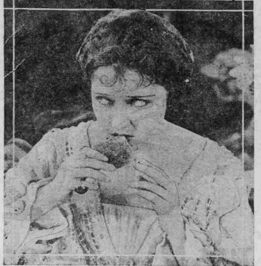
Gloria Swanson, who co-stars with Thomas Meighan in "Male and Female," the motion picture made from J. M. Barrie's "The Admirable Crichton," which is showing at the Columbia theater.