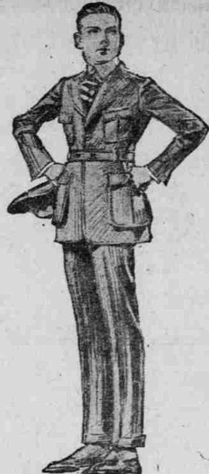
Copyright 1919, Hart Schaffner & Marx

Woven Madras Shirts Special $2.95 Regular value $4 All Sizes In a big run of patterns