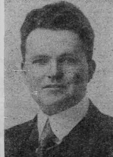
AMERICA'S NEW TENOR. CONCERT, PUBLIC AUDITORIUM MONDAY EVE.