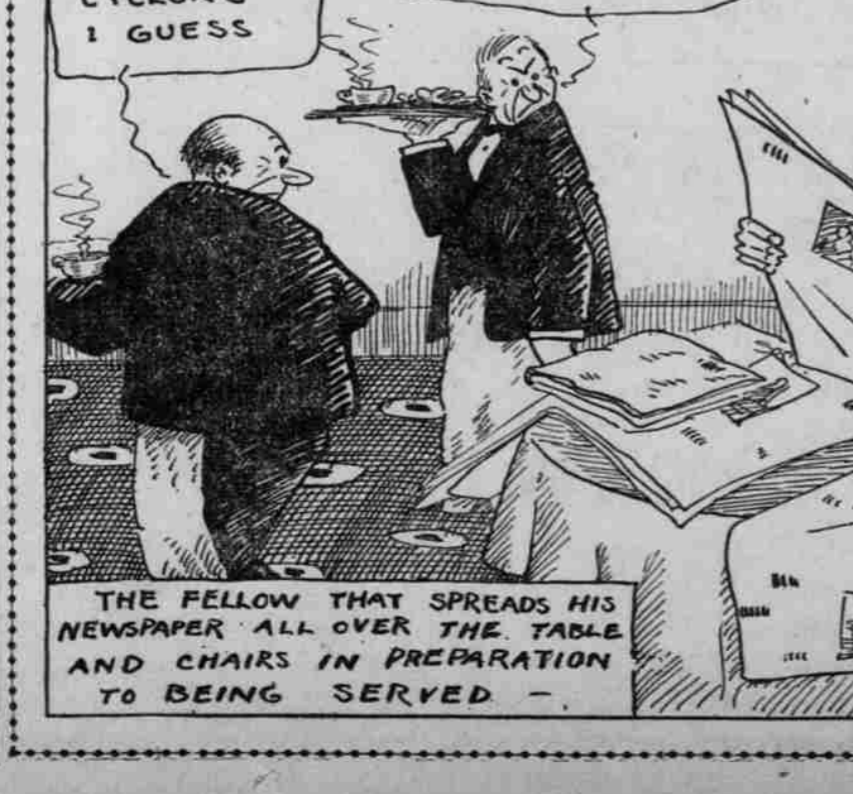
THE FELLOW THAT SPREADS HIS NEWSPAPER ALL OVER THE TABLE AND CHAIRS IN PREPARATION TO BEING SERVED.