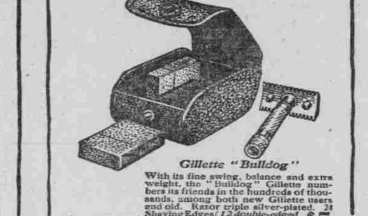
Gillette "Bulldog" With its fine swing, balance and extra weight, the "Bulldog" Gillette number 7 is the most popular of all razors. Razor triple silver-plated. 21 Shaving Edges (12 double-edged Blades). Genuine Leather Case. $5