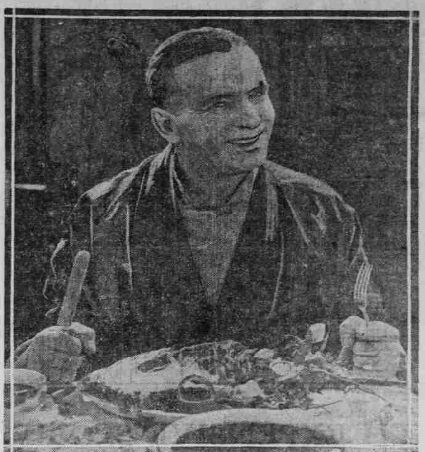
Douglas Fairbanks and the "frugal" meal with which he toys in his latest feature, "When the Clouds Roll By," which will open on Christmas day at the Majestic theater.

TODAY'S FILM FEATURES. Columbia—William S. Hart, "John Petticoats." Majestic—Special production, "When Bear Cat Went Dry." Liberty—Douglas Maclean and Doris May, "Twenty-Three and a Half Hours' Leave."