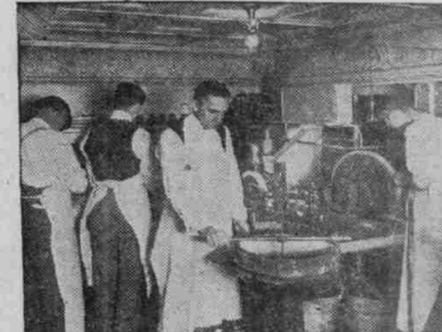
CORNER IN OPTICAL FACTORY

All of our watchmakers and jewelers are union watchmakers and jewelers