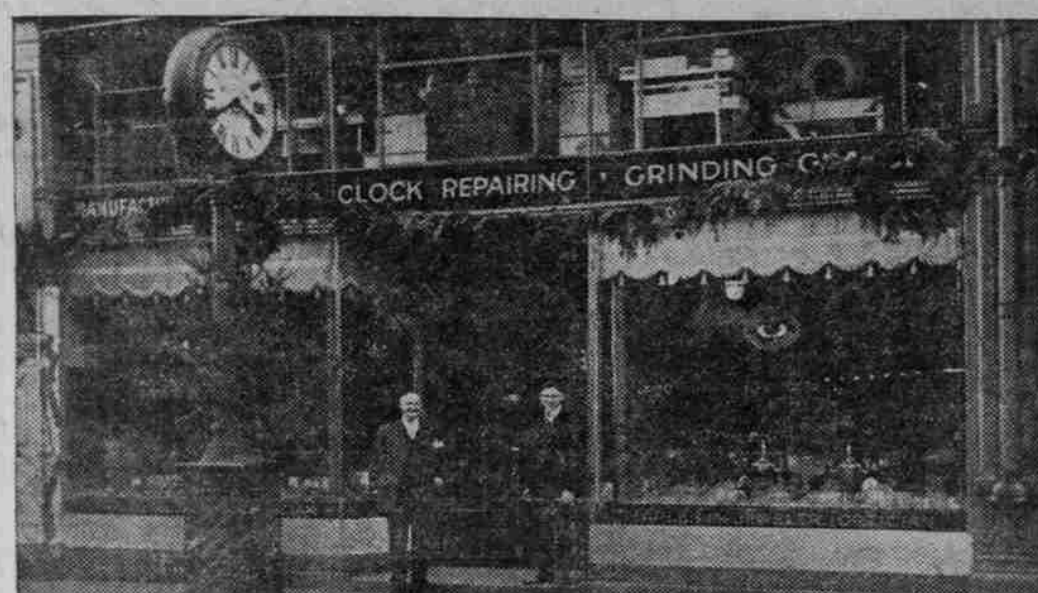
FRONT OF THE STORE, 266 MORRISON STREET, BETWEEN 3D AND 4TH STREETS

Hundreds of beautiful Diamonds—mounted—and ready for your inspection.