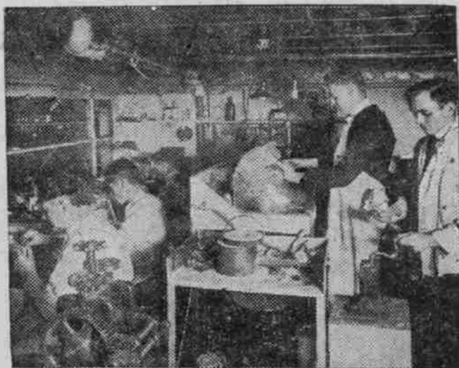
CORNER IN JEWELRY FACTORY

This store is fair to its customers; Fair to its employees; Fair to union labor.