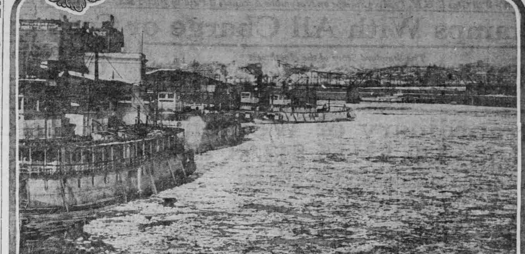
THE ABOVE VIEW WAS TAKEN FROM THE MORRISON-STREET BRIDGE YESTERDAY AFTERNOON BEFORE THE ICE BECAME SOLID. THE RIVER STEAMERS IN THE FOREGROUND ALL FLED IN SEARCH OF SAFER MOORING PLACES BEFORE EVENING.