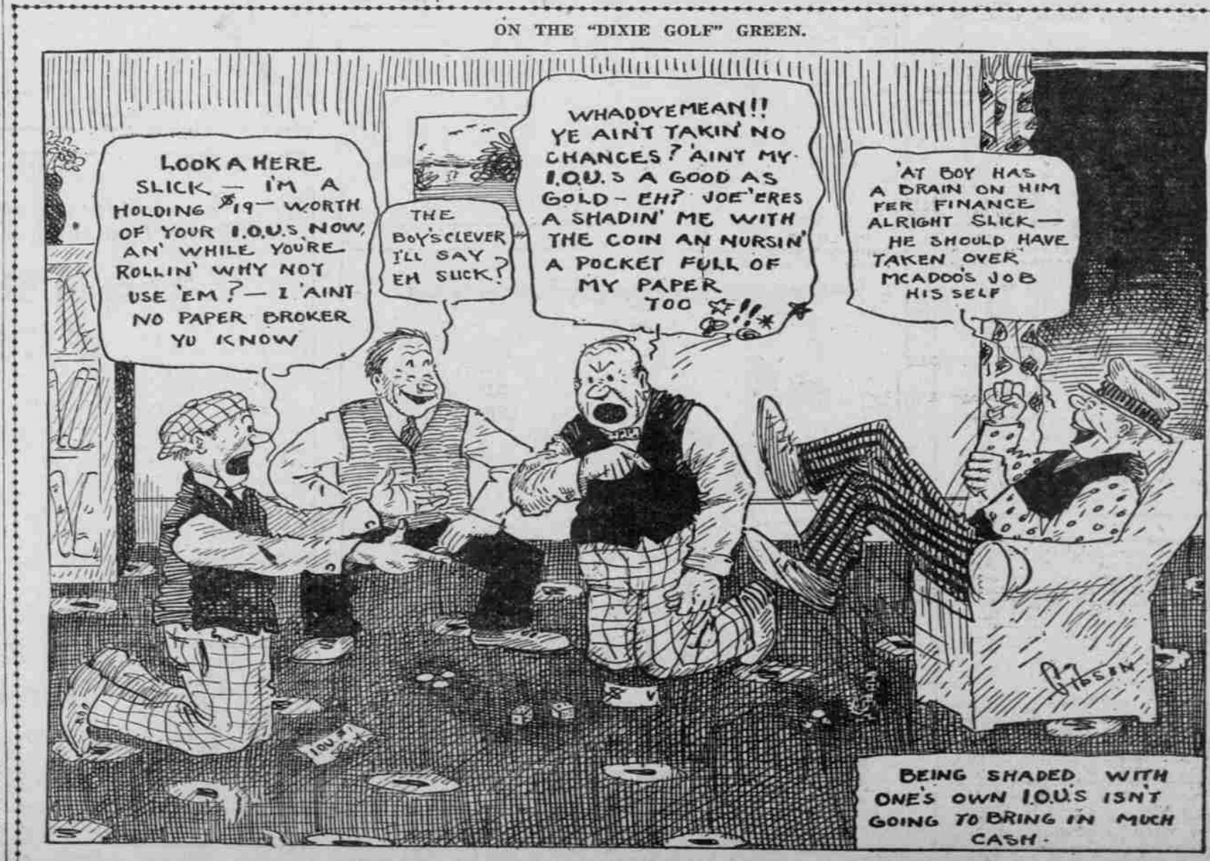
ON THE "DIXIE GOLF" GREEN.