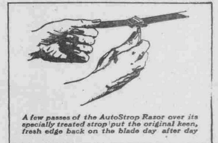
A few passes of the AutoStrop Razor over its specially treated stop put the original keen, fresh edge back on the blade day after day

The AutoStrop Razor is the only safety razor that sharpens itself, shaves, and cleans without removing a single part. A touch of the thumb adjusts the blade for close, medium, or light shaving.