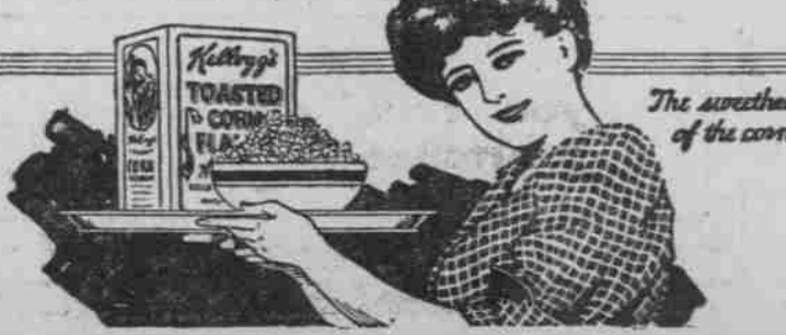
The sweetheart of the corn

Every grocer everywhere sells Kellogg's everyday to almost everybody.