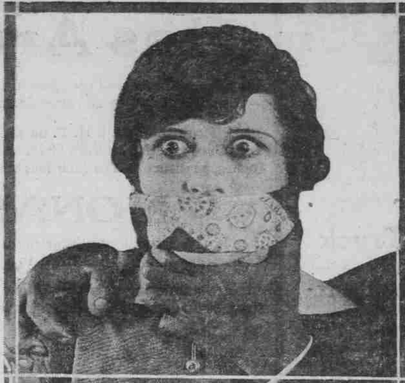
"LOOT," EXCITING FILM MELODRAMA, WHICH OPENED AT THE LIBERTY LAST NIGHT.