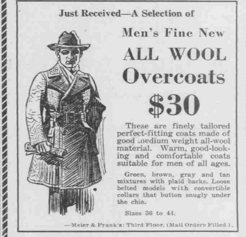
—Meler & Frank's Third Floor. (Mail Orders Filled).

Just Received—A Selection of Men's Fine New ALL WOOL Overcoats $30. These are finely tailored perfect-fitting coats made of good medium weight all-wool material.