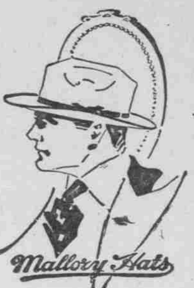
The style shown here is one of the new "Mallory Hats" for young men.

They're all good, all of fine materials, each a character in itself. You'll find a choice selection at this exclusive men's store.