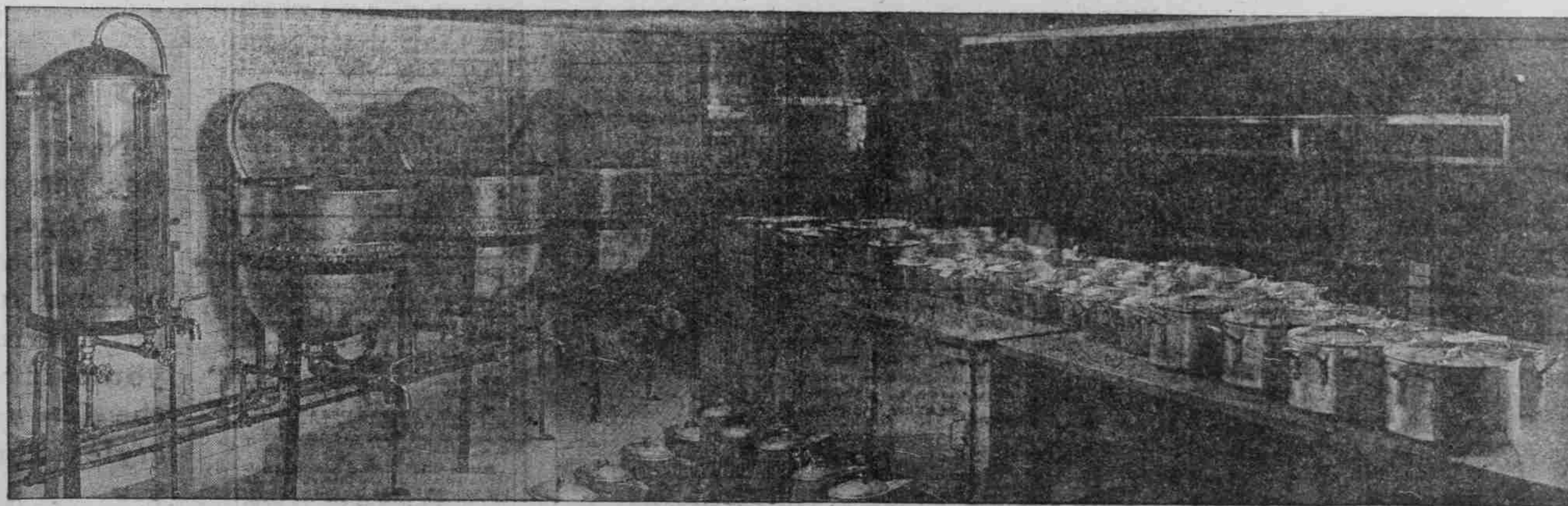
"Wear-Ever" Equipment Letterman (U. S. A.) General Hospital San Francisco, Cal.