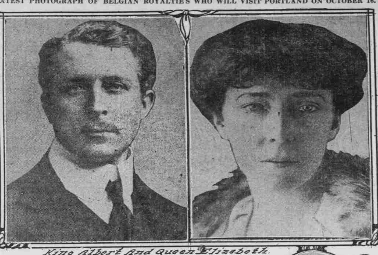
King Albert and Queen Elizabeth.