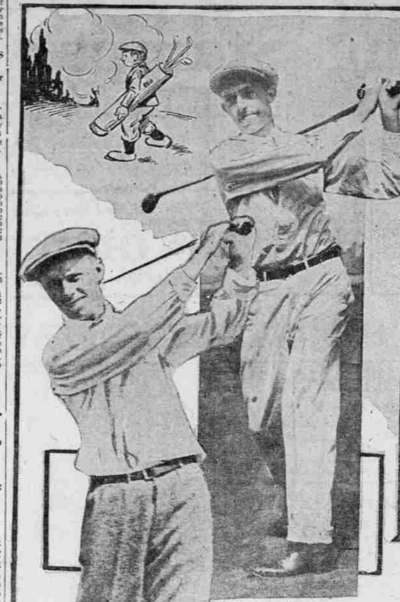
Charles "Chick" Evans, Chicago, and Francis Ouimet, Woodland.