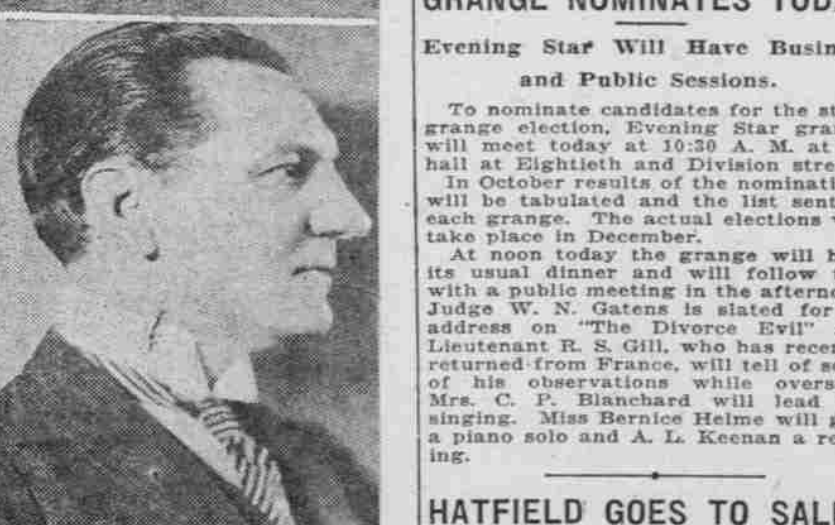
Guy Bates Post.