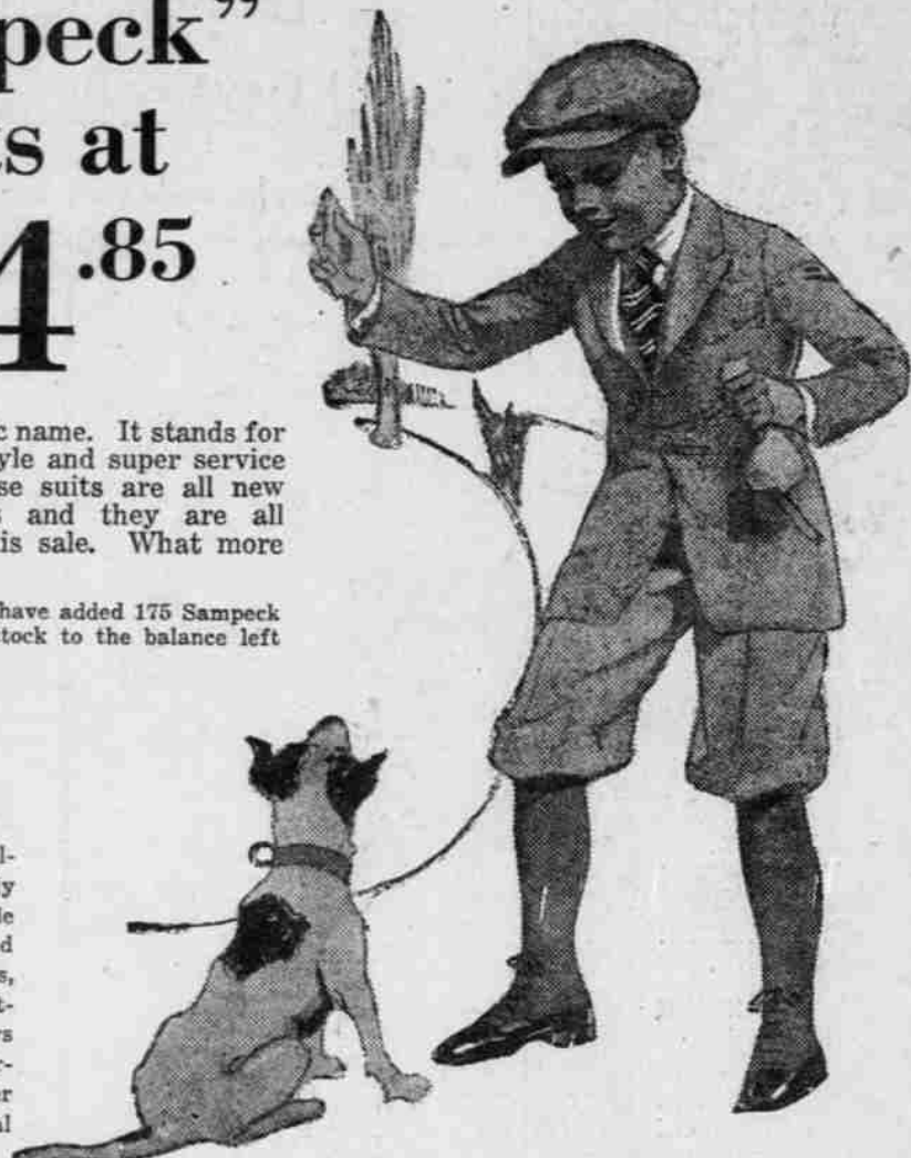
—Meier & Frank's: Third Floor. (Mail Orders Filled.)

and every garment is skillfully designed and carefully tailored of finely serviceable fabrics. Many patterns and colorings. All popular styles, including mannish "waist-seams." All sizes for boys 6 to 18 years. A special purchase direct from the maker accounts for the phenomenal value.