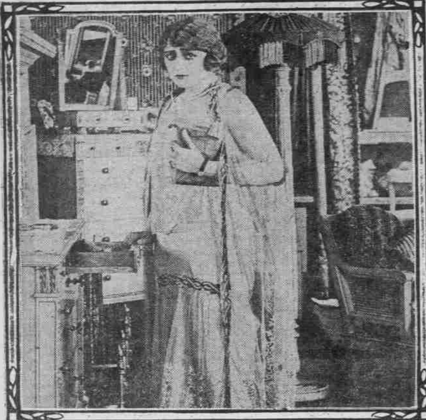
FLORENCE REED, IN DRAMATIC SCREEN PLAY, "WIVES OF MEN," WHICH OPENS TOMORROW AT MAJESTIC THEATER.