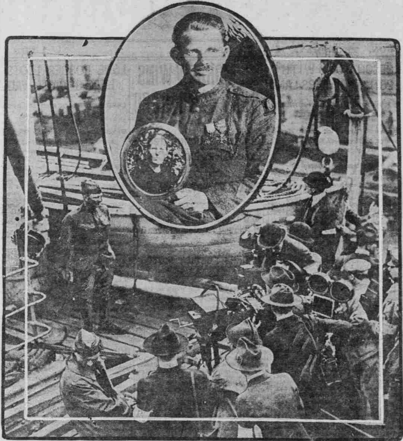
The photograph shows the crowd of photographers and newspaper men that swarmed about Sergeant Alvin C. York upon his arrival in New York, while the insert is a close-up of the hero. The photo of the bespectacled lady he holds in that of his mother, whom he yearns to embrace.