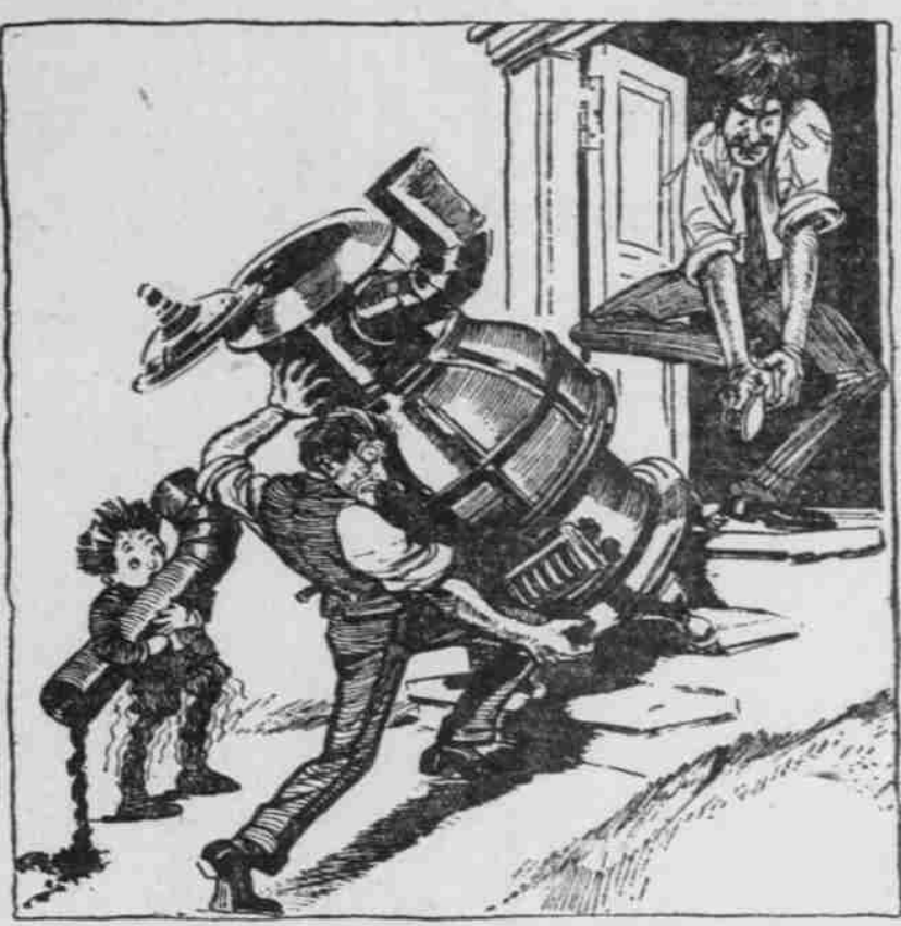
"Never again, Jim! Here's where I buy radiator heating!"

RINGLER'S DANCING ACADEMY Cotillion Hall 14th St. at Washington, Hdwy. 3380.