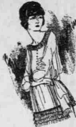
As Sketched. Third Floor—Lipman, Lipman, Wolfe & Co.

—You've been seeing just such blouses illustrated in the fashion magazines of highest authority.