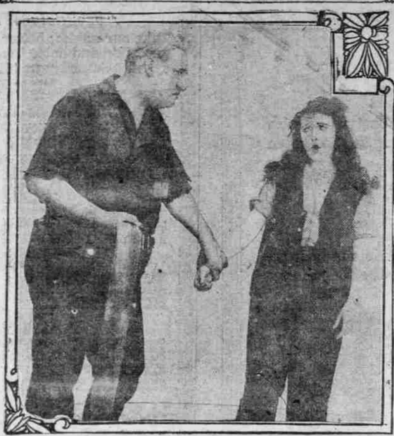
MABEL NORMAND, IN SCENE FROM THE SENSATIONAL COMEDY-SUCCESS, "MICKY," WHICH OPENS AT SUNSET THEATER TOMORROW.

TODAY'S FILM FEATURES. Liberty—Anita Stewart, "Virtuous Wives"; Fatty Arbuckle, "Love." Peoples—Dorothy Gish, "Boots." Columbia—Shirley Mason, "The Winning Girl." Majestic—Madge Kennedy, "The Kingdom of Youth." Star—Bessie Barriscale, "The Heart of Rachel." Sunset—Suzanne Hayakawa, "His Birthright." Globe—Frank Keenan, "The Midnight Star." Circle—Suzanne Hayakawa, "The White Man's Law."