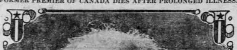
SIR WILFRID LAURIER.