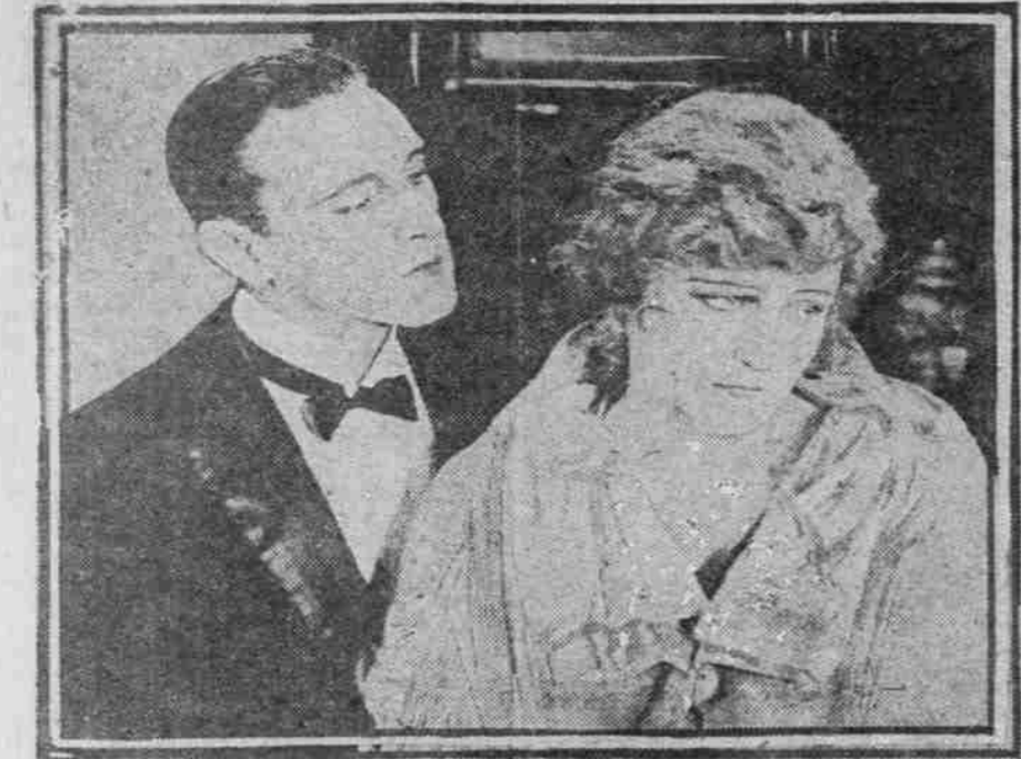
JOHN BARRYMORE, IN SCENE FROM "RAFFLES, THE AMATEUR CRACKSMAN," PHOTOPLAY, COMING TO SUNSET THEATER TOMORROW.

TODAY'S FILM FEATURES. Sunset—William S. Hart, "Wolf Lowry." Liberty—Ethel Clayton, "Maggie Pepper." Peoples—Thomas Dixon's "The One Woman." Columbia—Ruth Clifford, "The Game's Up." Majestic—Geraldine Farrar, "Shadows." State—Vivian Martin, "You Never Saw Such a Girl." Globe—Dustin Farnum, "Captain Courtesy." Circles—Marguerite Clark, "The Valentine Girl."