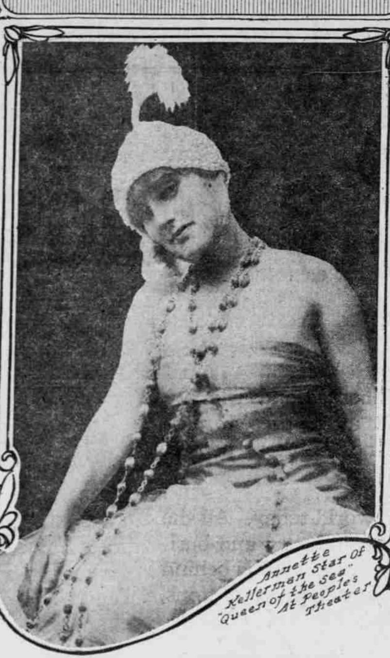
Annette Kellerman Star of 'Queen of the Sea' at Peoples Theatre

Worry, bad temper and insomnia—all calculated to make people thin. He has even figured it out that oranges are taboo.