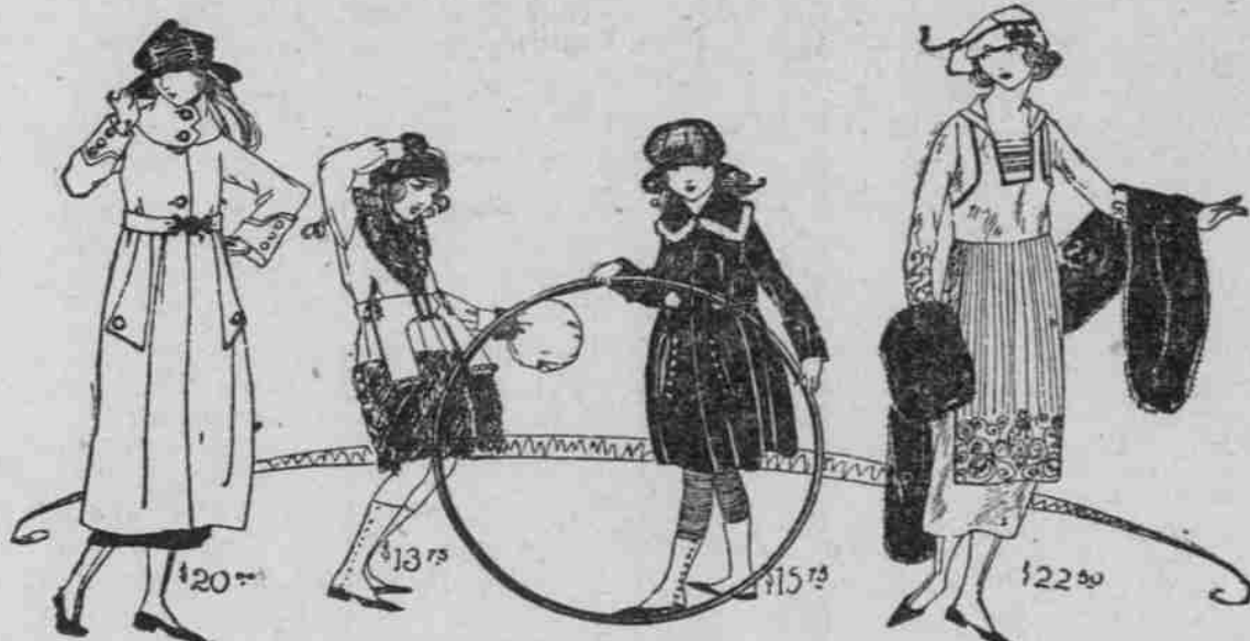
For the First Time in Our Business Experience

See Page 6 for Appropriate Gifts in the Men's Shop