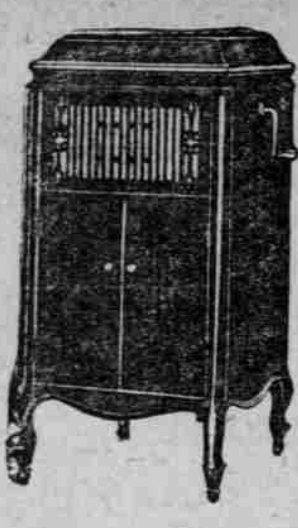
$32.50 to $1500

The repeal of the law providing for road viewers is proposed in one set of resolutions, while the establishment of a star mail route from Willamina to Hebo is also sought. Elimination of the publication of special tax levies in cities, road districts and school districts is opposed because of its alleged waste of money. The morning session of the judges and commissioners yesterday was devoted to a discussion of relief work.