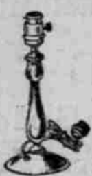
Mahogany Finished Lamp, one light, complete with 6 feet of electric cord, as illustrated, special..... $1.95

We have a whole section devoted to useful and desirable articles in gift furniture. Our stocks include book ends, candlesticks, floor lamps, serving trays, tea wagons, foot stools, piano benches, tip top tables, wall tables, decorated baskets, sweetmeat boxes, Chinese decorated novelties, etc. A few suggestions: