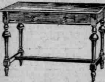
Jacobean Library Table, top measures 28x48 inches, one drawer with wood pulls, special..... $19.85