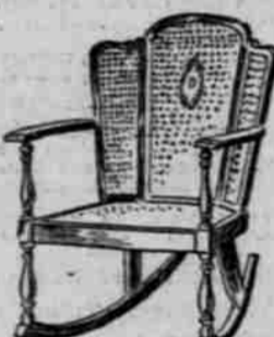
Mahogany Chair or Rocker with cane seat and back, priced..... $15.75

Our Furniture Shop on the Eighth Floor has never been as well stocked with medium priced furniture as at the present time. Here are two good values for those who come today: