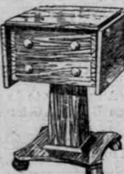
Mahogany Colonial Serving Table, has two drop leaves and two drawers, as illustrated, special..... $15.95