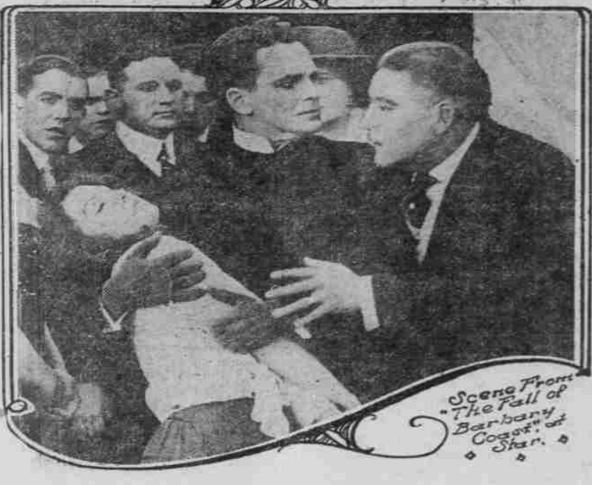
Scenes From 'The Fall of Barbary the Coast'